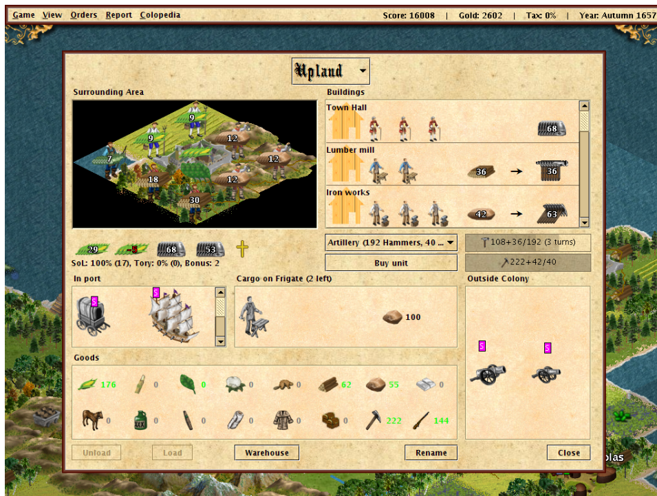
Figure 3.3: The Colony Panel

a different kind of work. If a tile has a red border, then it is being used by another colony or settlement. Please note that you can not use water tiles until you have built docks .