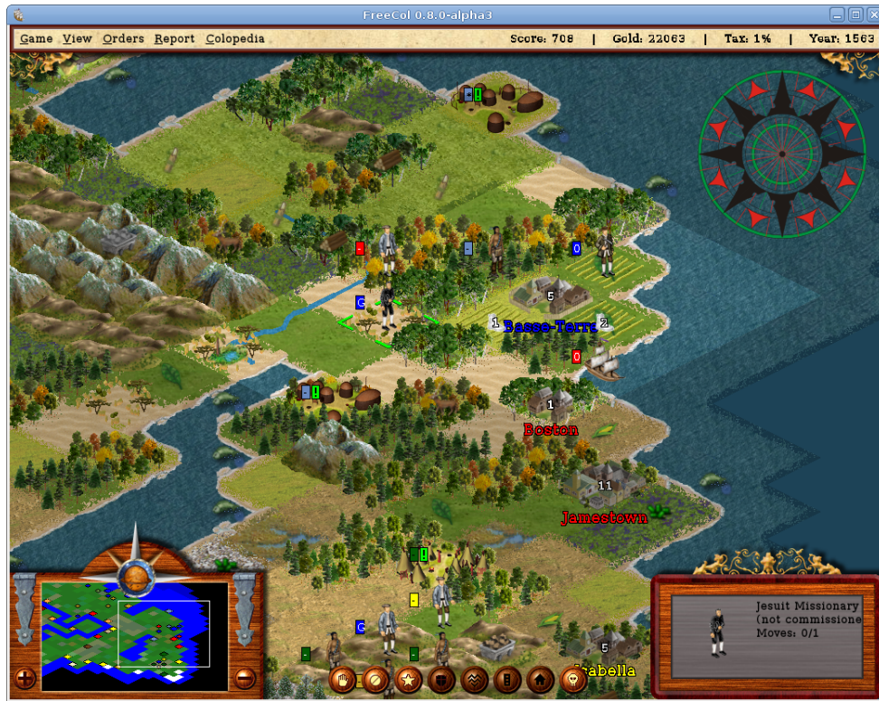
Figure 3.1: The main screen.